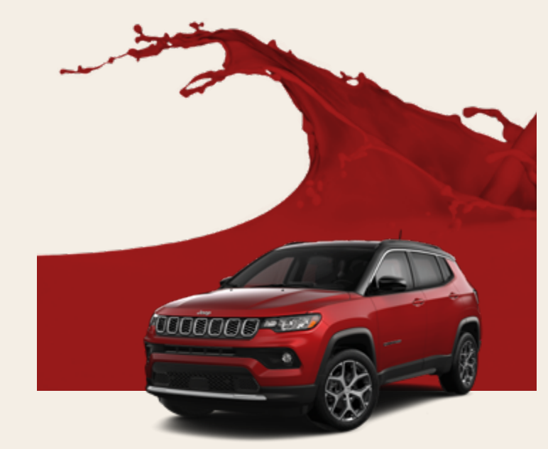
Red Hot Pearl